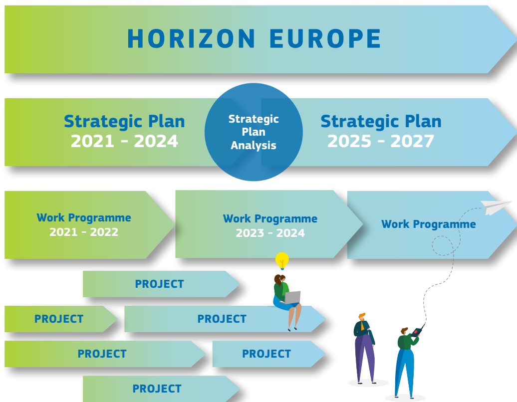
Figure 1 – Implementing Horizon Europe